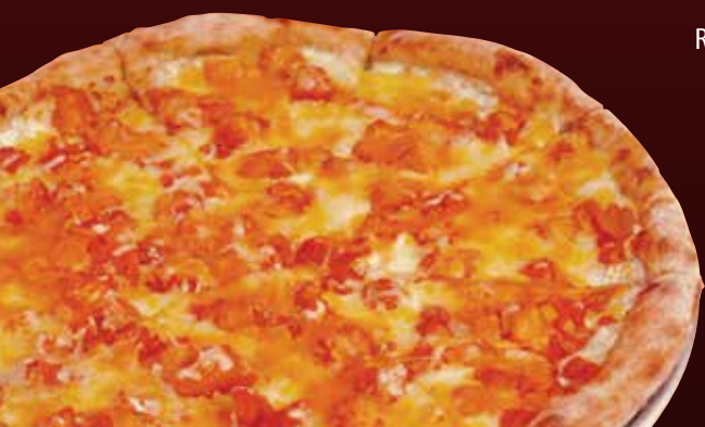
Buffalo Chicken Specialty Pizza

White: mashed potatoes, cheese, kielbasa, and sauerkraut Red: pizza sauce, cheese, kielbasa, and sauerkraut Small 10.50 Medium 13.50 Large 16.50